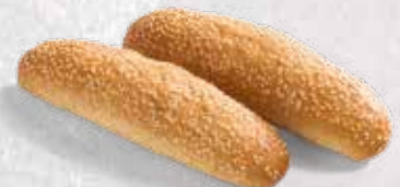
BAGUETTE WITH SESAME SEEDS