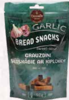
SWEET-AND-SOUR BREAD SNACKS WITH GARLIC