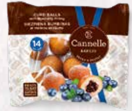
CURD BALLS WITH BLUEBERRY FILLING 4401 🐾 210 g 📦 12 pcs ❄️ 1,5 h