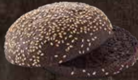
CHARCOAL BURGER BUN