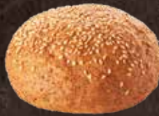
WHOLE GRAIN BURGER BUN