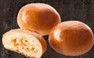
MINI PIES WITH CABBAGE FILLING