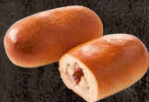
PIES WITH SMOKED MEAT FILLING