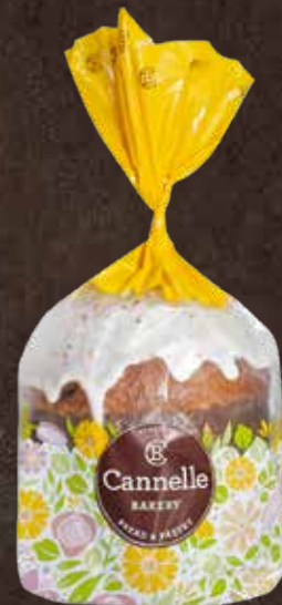
EASTER BREAD, RETAIL PACKED