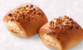
SNACKS WITH CURD FILLING