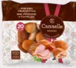
20 MINI PIES WITH SMOKED MEAT FILLING 2128 🐾 200 g 📦 12 pcs ❄️ 60 min