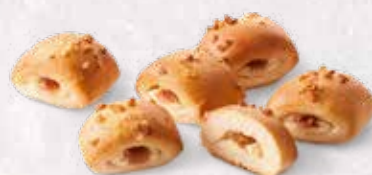
SNACKS WITH CURD AND REDCURRANT FILLING