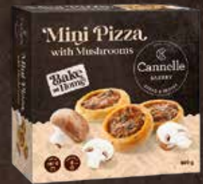
MINI PIZZA WITH MUSHROOMS