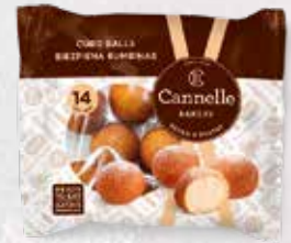
CURD BALLS 4406 🐾 210 g 📦 12 pcs ❄️ 1,5 h