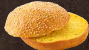
YELLOW BURGER BUN