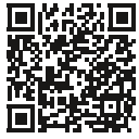
PIZZA DOUGH 700 g 4,9 kg