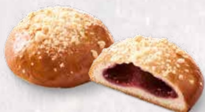
COFFEE BREAD WITH CHERRY FILLING