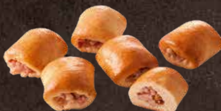
SNACKS WITH SMOKED MEAT FILLING AND SUNFLOWER SEEDS