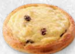
COFFEE BREAD WITH CURD AND RAISINS