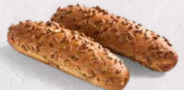
BAGUETTE WITH SEEDS