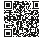
DUMPLING DOUGH 700 g 4,9 kg