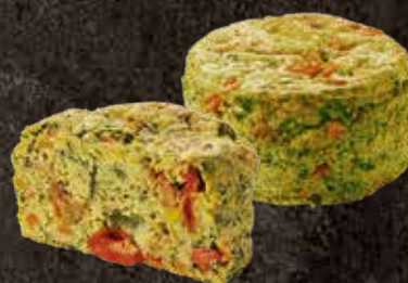
MINI FRITTATA WITH PAPRIKA