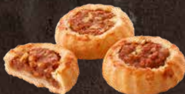
SHORTCRUST PASTRY WITH SALTY CARAMEL AND PEANUT FILLING