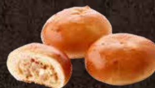
MINI PIES WITH CHICKEN FILLING