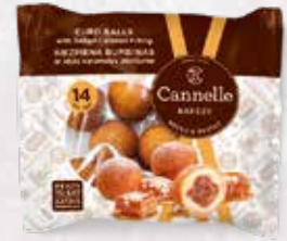
CURD BALLS WITH SALTED CARAMEL FILLING 4402 🐾 210 g 📦 12 pcs ❄️ 1,5 h