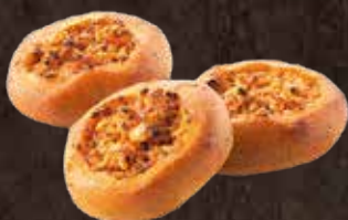
MINI PIZZA WITH PEPPERONI