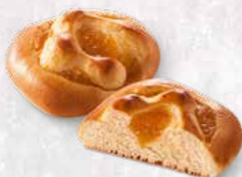
COFFEE BREAD WITH APRICOT FILLING