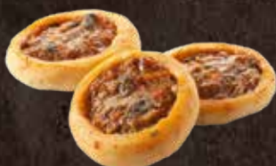
MINI PIZZA WITH MUSHROOMS