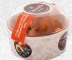
CURD BALLS WITH BLUEBERRY FILLING 142 🐾 130 g 📦 12 pcs ❄️ 60 min

RICH IN CURD 60%, EGG AND BUTTER TOP SELLER