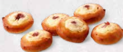
MINI BUN WITH CUSTARD CREAM AND RASPBERRY FILLING