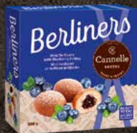
MINI BERLINERS WITH BLUEBERRY FILLING