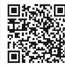
WHEAT BREAD DOUGH 233 600 g 7,2 kg