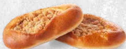
PIE WITH APPLE FILLING