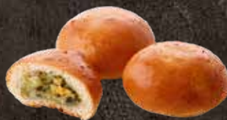
MINI PIES WITH EGG AND SPINACH FILLING