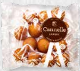
CANNELLE BAKERY FLOW PACK 🐾 200 g - 260 g 📦 12 pcs