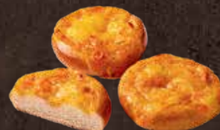
OPEN PIES WITH CHEESE AND CARROT FILLING