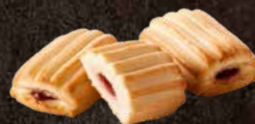
SHORTCRUST PASTRY WITH CURD AND BLUEBERRY FILLING