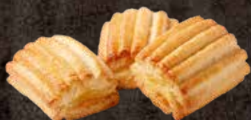
SHORTCRUST PASTRY WITH CURD FILLING