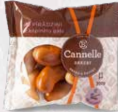
10 PIES WITH SMOKED MEAT FILLING 2129 🐾 200 g 📦 12 pcs ❄️ 60 min