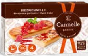
CURD CAKE 2513 🐾 300 g 📦 12 pcs ❄️ 1,5 h

RICH IN CURD 60%, EGG AND BUTTER TOP SELLER