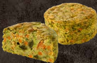
MINI FRITTATA WITH MUSHROOMS