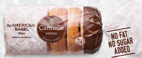
6 PLAIN BAGELS, PRE-SLICED 3101 🐾 480 g 📦 9 pcs ❄️ 1,5 h