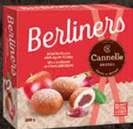
MINI BERLINERS WITH APPLE FILLING