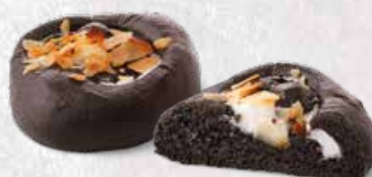
BLACK COFFEE BREAD WITH CREAM FILLING