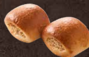
SNACKS WITH MINCED MEAT FILLING