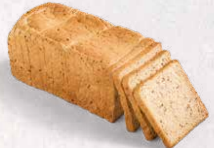
SANDWICH BREAD WITH SEEDS