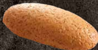
CEREAL BREAD WITH NO SUGAR ADDED

HIGH FIBRE CONTENT NO FAT NO SUGAR ADDED