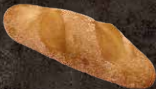
GRAIN AND SEEDS SCONE