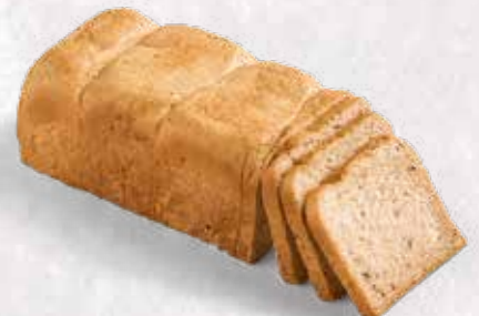
SANDWICH BREAD WITH FIBER