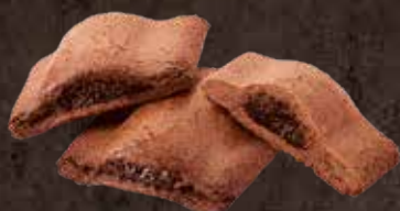
DARK SHORTCRUST PASTRY WITH PLUM FILLING