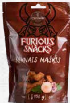
SWEET-AND-SOUR BREAD FURIOUS SNACKS