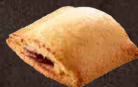
SHORTCRUST PASTRY WITH CURD AND REDCURRANT FILLING