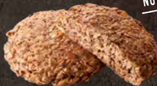
GRAIN AND SEEDS SCONE