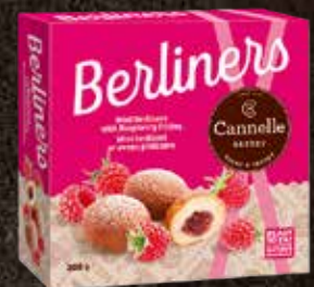
MINI BERLINERS WITH RASPBERRY FILLING