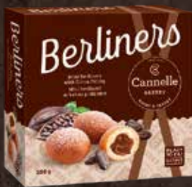
MINI BERLINERS WITH COCOA FILLING