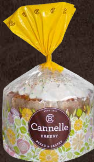
EASTER BREAD, RETAIL PACKED