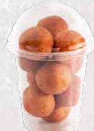
CURD BALLS WITH ANY FILLING 🐾 150 g 📦 12 pcs ❄️ 60 min