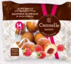
CURD BALLS WITH RASPBERRY FILLING 4403 🐾 210 g 📦 12 pcs ❄️ 1,5 h