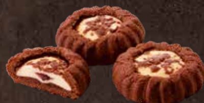
DARK SHORTCRUST PASTRY WITH CURD AND REDCURRANT FILLING