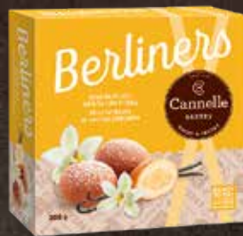
MINI BERLINERS WITH VANILLA FILLING