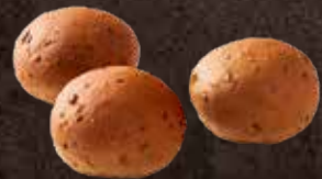
DARK BUN WITH SEEDS