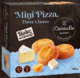
MINI PIZZA WITH CHEESE