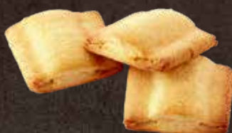
SHORTCRUST PASTRY WITH CURD FILLING