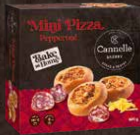
MINI PIZZA WITH PEPPERONI