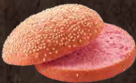
PINK BURGER BUN