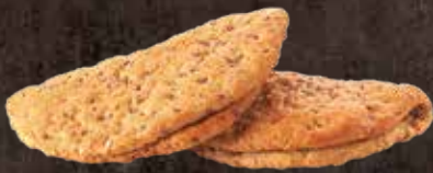
FOLDED SEED BREAD