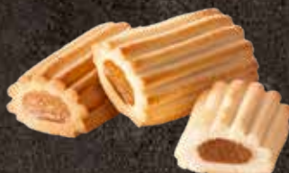
SHORTCRUST PASTRY WITH CONDENSED MILK FILLING