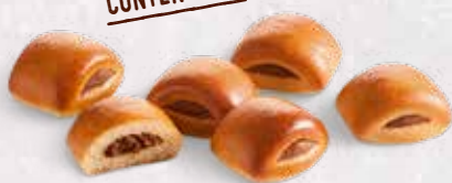
MINI ROLLS WITH CINNAMON FILLING