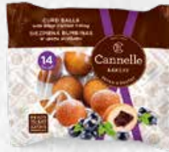
CURD BALLS WITH BLACK CURRANT FILLING 4404 🐾 210 g 📦 12 pcs ❄️ 1,5 h