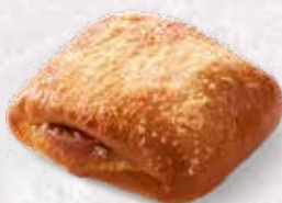
COFFEE BREAD WITH JAM FILLING