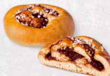
CINNAMON BUN WITH PEARL SUGAR