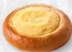
COFFEE BREAD WITH CUSTARD CREAM FILLING