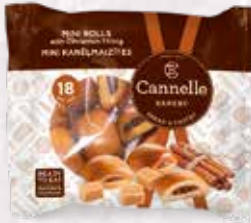
MINI ROLLS WITH CINNAMON FILLING 2610 🐾 260 g 📦 12 pcs ❄️ 60 min