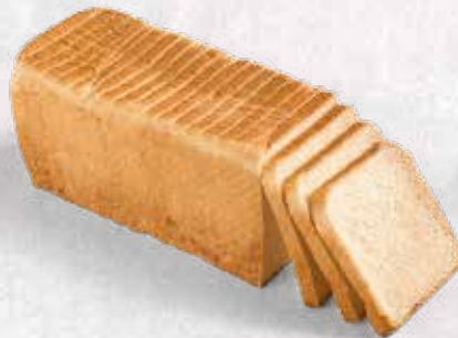
WHITE SANDWICH BREAD