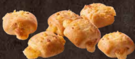
SNACKS WITH CHEESE FILLING AND TOPPING