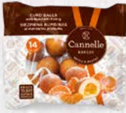
CURD BALLS WITH MANDARIN FILLING 4405 🐾 210 g 📦 12 pcs ❄️ 1,5 h