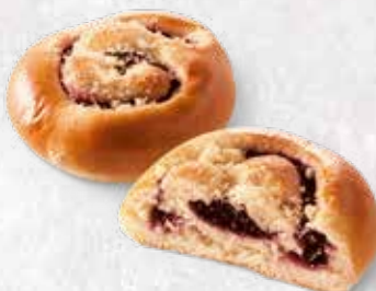
COFFEE BREAD WITH BLUEBERRY FILLING