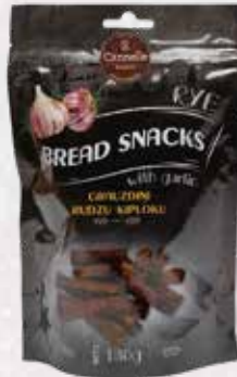
RYE BREAD SNACKS WITH GARLIC