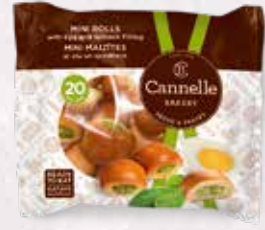
MINI ROLLS WITH EGG AND SPINACH FILLING 4300 🐾 240 g 📦 12 pcs ❄️ 60 min