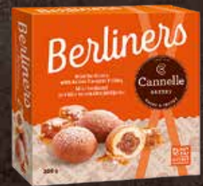
MINI BERLINERS WITH SALTED CARAMEL FILLING