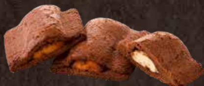
DARK SHORTCRUST PASTRY WITH CURD AND HAZELNUT FILLING