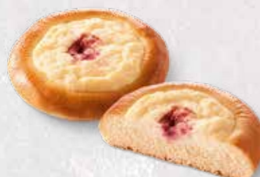
COFFEE BREAD WITH CURD AND COWBERRY FILLING